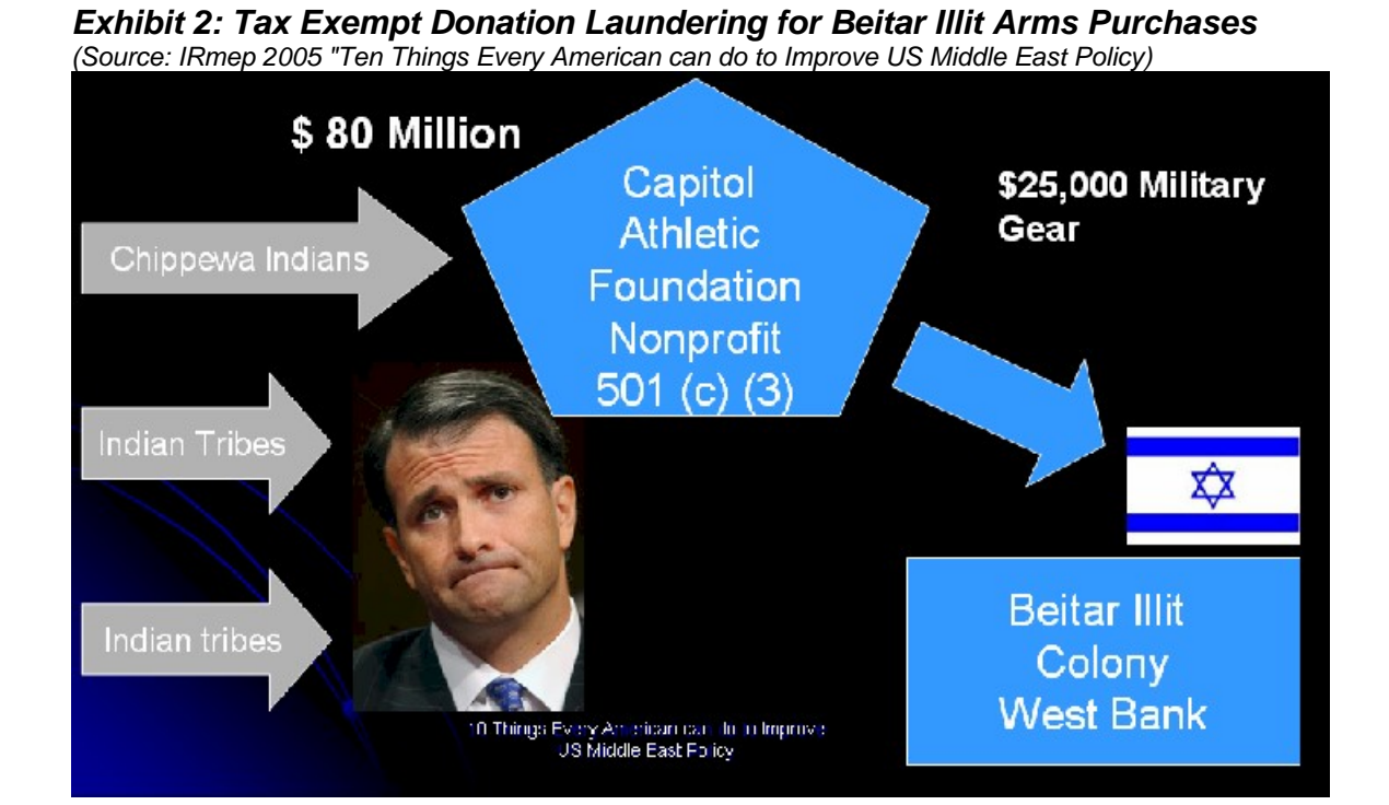
October 5, 2005 Policy Research Note

Washington Lobbyist Jack Abramoff laundered money from the Choctaw Chippewa Indian tribe into a non-descript 501 (c) (3) called the "Capital Athletic Foundation" (CAF). In addition to funding the illegal West Bank Beitar Illit colony, CAF directly procured sniper scopes, camouflage suits, night-vision binoculars, a thermal imager and shooting mats so that Israeli settlers could intimidate or shoot Palestinian Arabs moving through newly captured land. The shipment of military hardware from the US to Israel was to be expedited via signed letter from a commander in the Israeli Defense Force (IDF) in order to guarantee "end user" clearance for arms exportation from the U.S. State Department.